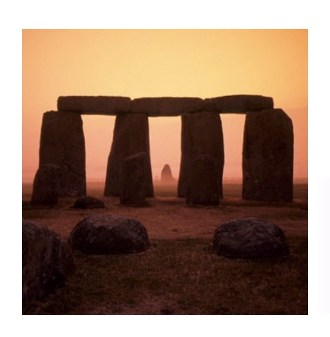
Image of Stonehenge: Wessex Archaeology/Flickr Used under Creative Commons licence